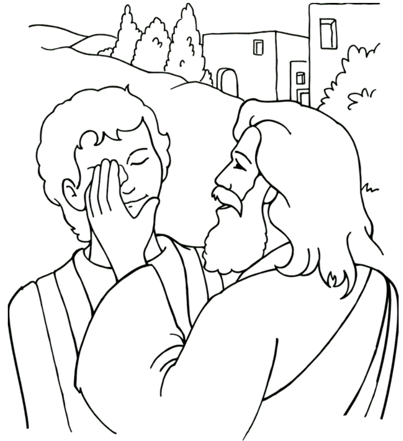
Jesus heals a blind man. John 9

From Thru-the-Bible Coloring Pages for Ages 4-8. © 1986, 1988 Standard Publishing. Used by permission. Reproducible Coloring Books may be purchased from Standard Publishing, www.standardpub.com , 1-800-543-1301.