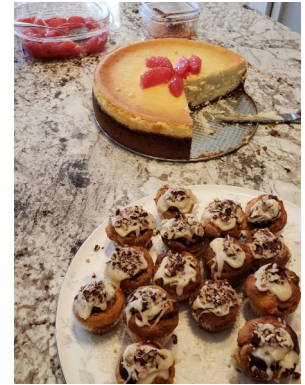
Grapefruit Cheesecake and Mini Bananas Foster Sticky Buns were two of the delicious dishes served at the Cooking Club gathering.