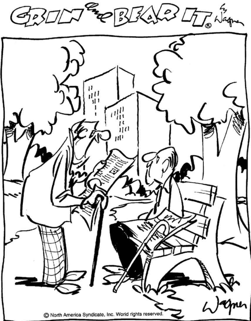
“Good news! We’re not in the obits today!”