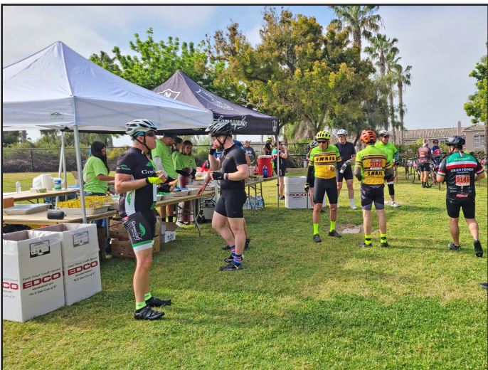
Rest Stop 4 at the height of the event. Per Martin