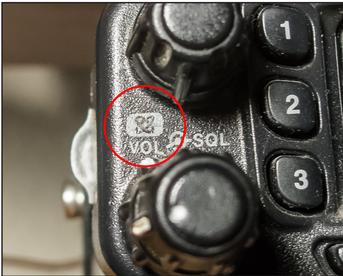
The WIRES Symbol on the front panel of a Yaesu FT-8900R.

Remember, these skills are perishable. ⚡