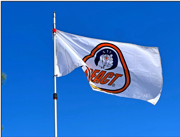
REACT flag displayed at Rest Stop 2. Daniel McDougal