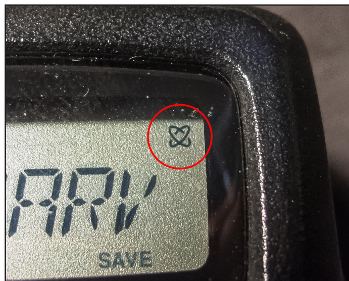
The WIRES Symbol as it appears on the screen of a Yaesu FT-60 handheld. This may appear differently on different radios. Refer to the manual to be sure.