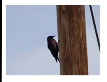
Lewis' Woodpecker John Groves

We started out the trip at Vinton, TX where we had a good view of Lewis's Woodpecker! From there we went to Dripping Springs. Despite the wind and cold temps, we had a nice hike up to the weeping wall, where we had desert specialties such as the Black-throated Sparrow, Canyon Towhee, Pyrrhuloxia,