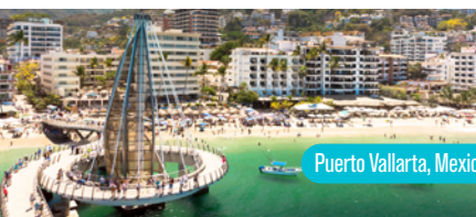
Puerto Vallarta, Mexico