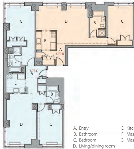
New floor plan with adjoining foyer