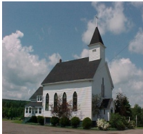
Saint Lawrence O'Toole 2340 Route 115 Irishtown, NB