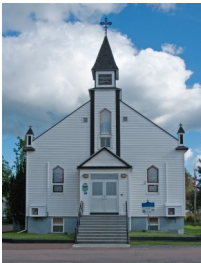
Our Lady of Mercy 11 St. Andrews Street Pointe-du-Chêne, NB