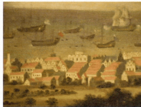
17th Century Barbados

Classroom version menu is divided into topical segments – Dutch - World History, Slavery, Sugar Production, high tech archaeology, religious toleration and more