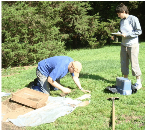
Manor of St. George - 2010