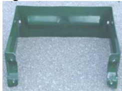
Top of Mount