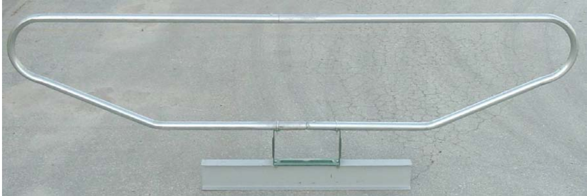
Mounted Loop-No Sleeve & No Welding Required