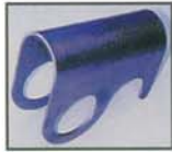
LOOP HOLDER One per Loop