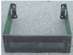
Bottom of Mount