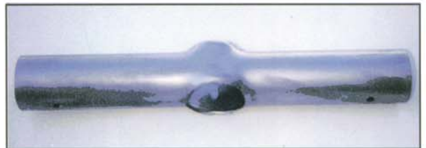
TWO-IN-ONE SLEEVE - One Per Loop

INSTALL YOUR LOOPS IN HALF THE TIME WITH MINIMUM WELDING USING THE TWO-IN-ONE SLEEVE