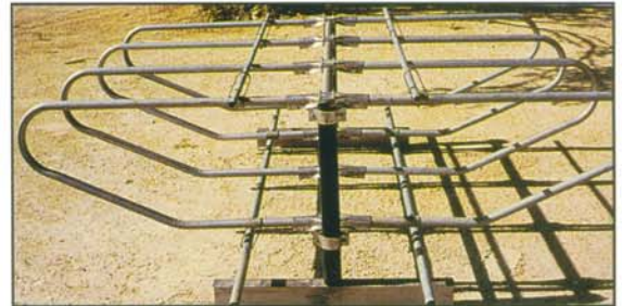
FIXED LOOP - No Welding Required