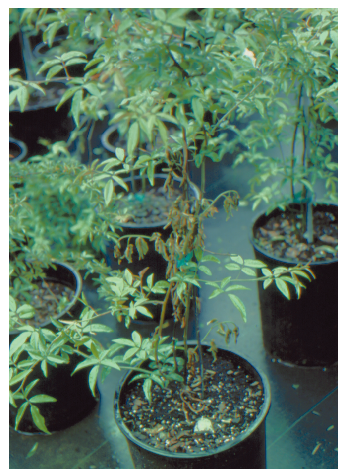
Figure 5. Botrytis Blight on 'Lady Banks' rose