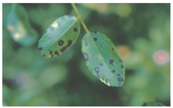
Figure 7. Cercospora leaf spot on a shrub rose

and infection of the leaves. Frequent rain showers or possibly overhead watering favors continued disease spread until the first hard frost in the fall.