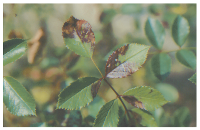
Figure 6. Leaf symptoms of downy mildew

CONTROL PRACTICES. In landscapes, removing diseased canes and establishing roses in full sun can minimize the occurrence of downy mildew. On greenhouse-grown roses, vent the house in the late afternoon and maintain the relative humidity below