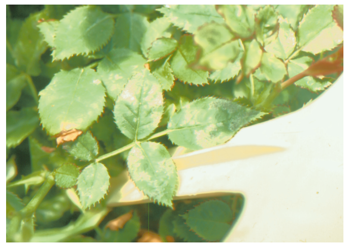
Figure 3. Powdery mildew in rose leaves

DISEASE CYCLE. The mildew fungus, Sphaero-theca pannosa , overwinters primarily in dormant buds, but the fungus may survive on leaves and canes during mild winters. Fungal spores are produced on diseased buds and are spread to expanding leaves by air currents. Infection occurs at temperatures of 70 degrees to 80 degrees F when the relative humidity is 90 to 99 percent.