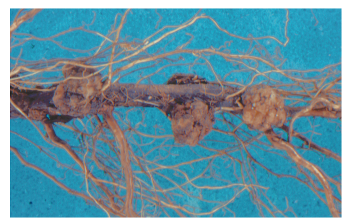
Figure 8. Crown gall on rose

CONTROL PRACTICES. Inspect the roots and crown of roses for galls before planting. When planting or cultivating roses, avoid wounding the roots or crown of the plants. The root system of bare-root roses may be protected from crown gall with a pre-lant root-dip of the biological control agents Galltrol-A or Norbac 84-C. Fumigation of new or renovated rose beds is suggested before planting. Directions for the use of fumigants are discussed in Extension publication ANR-30, "Nematode Control in the Home Garden." Dip pruning tools in 70percent alcohol or wash shovels or other digging equipment before working in another bed to prevent the spread of bacteria-infested soil. Destroy diseased roses and fumigate the area where the plants were removed. Where crown gall is a serious problem, consider replanting the area with woody ornamentals resistant to crown gall such as azalea, boxwood, crape myrtle, photinia, or wax myrtle.