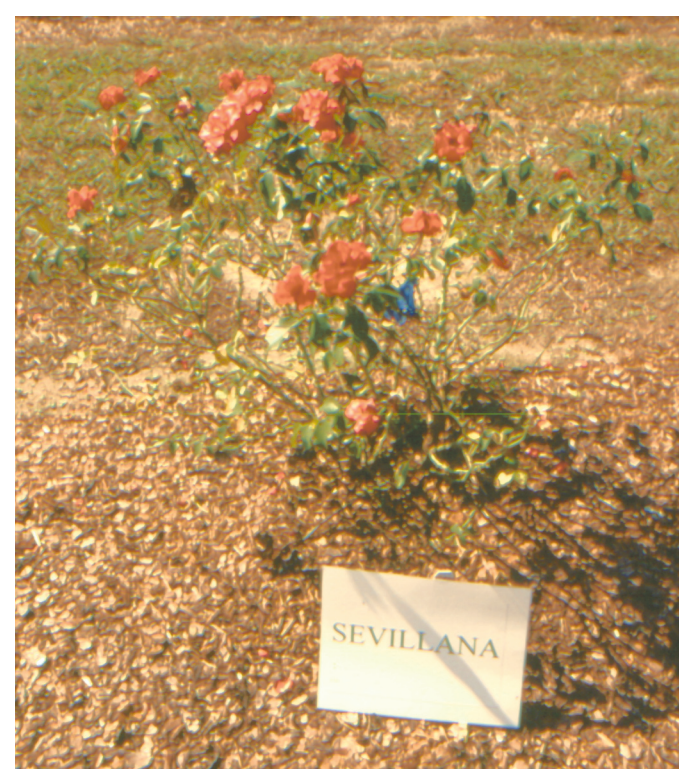
Figure 2. 'Sevillana' rose defoliated by blackspot

disease (Figure 2). Typically, leaf shed begins at the base of the canes and gradually spreads upward until all but the youngest leaves are lost. Heavy leaf shed reduces flower production and plant vigor. If severe drought or cold weather conditions further stress blackspot-damaged roses, the plants may die.