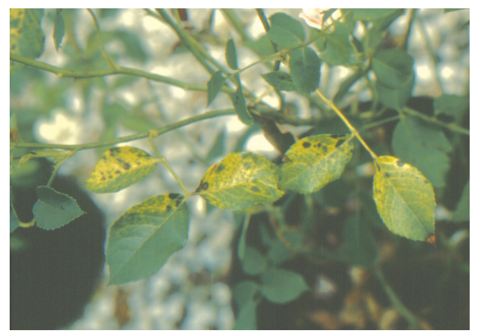
Figure 1. Blackspot. Note yellowing of diseased leaves.

SYMPTOMS. Rose leaves and canes often show symptoms of this disease, which is caused by the fungus Diplocarpon rosae . Brown to black circular spots (¼ to ½ inch in diameter) are seen on both leaf surfaces (Figure 1). A fringed margin around each leaf spot is characteristic of black spot on rose. Usually, the disease first appears on the leaves at the base of each cane. As symptoms continue to develop, a yellow margin or halo develops around each spot. Several spots may grow together and form large blotches. Large yellow blotches often appear on heavily spotted leaves just before they fall from the plant. Defoliation caused by blackspot is perhaps the most common symptom of this