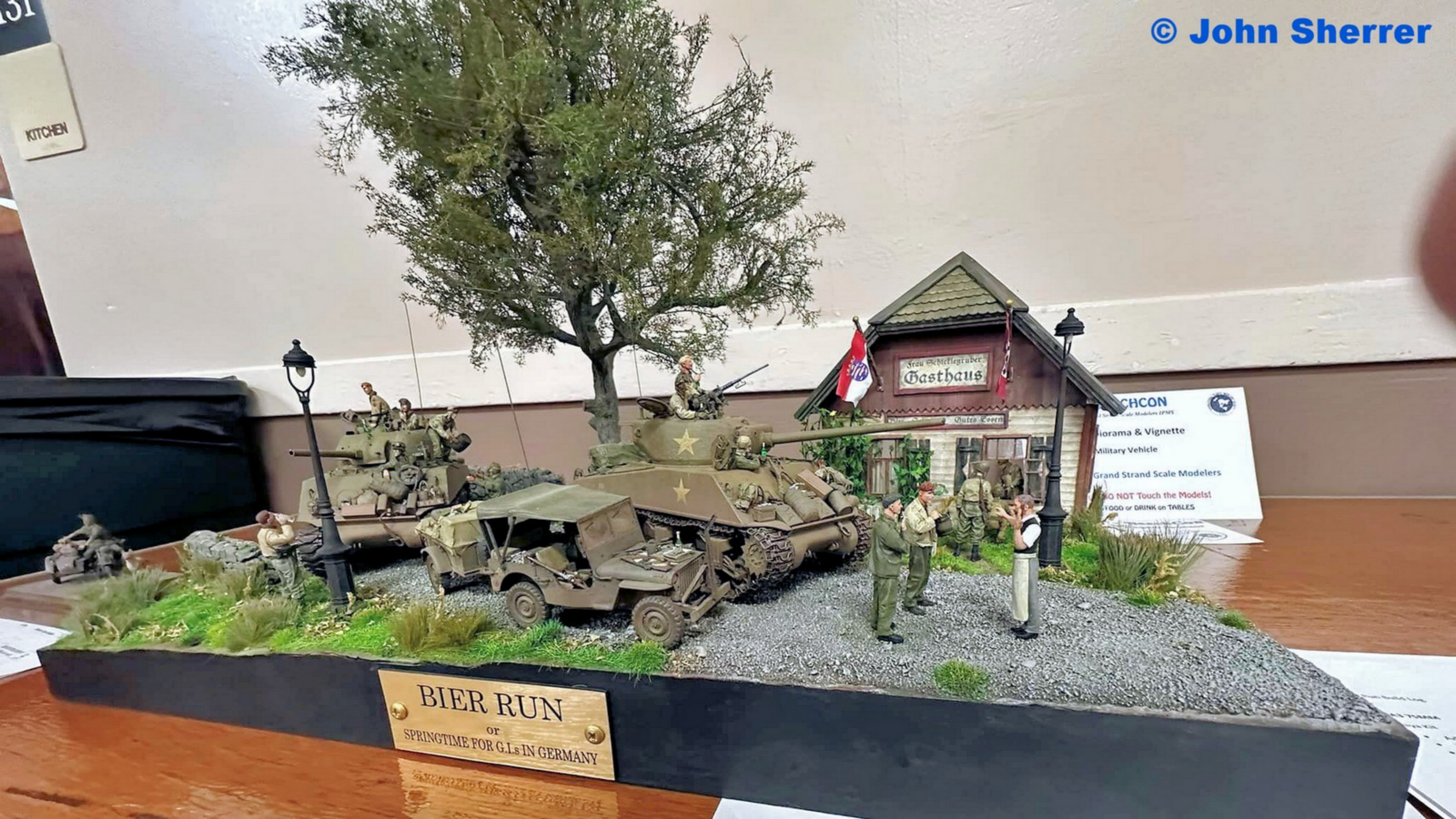
BIER RUN OR SPRINGTIME FOR G.I.s IN GERMANY

HCHCON Diorama & Vignette Military Vehicle Grand Strand Scale Modelers DO NOT Touch the Models! NO FOOD or DRINK on TABLES