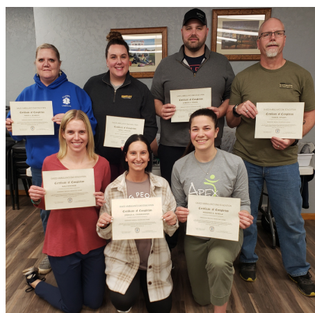
2022-2023 EMT GRADUATES