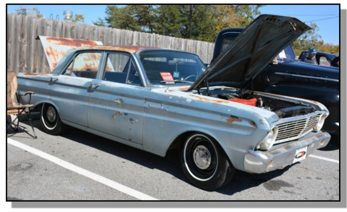
MORE photos on our our Facebook page.