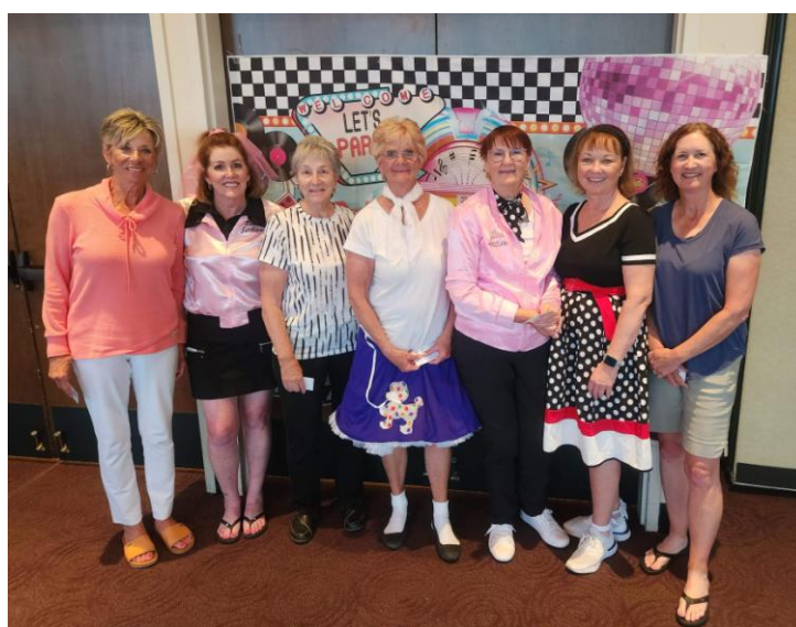
2 nd Place Winners – Gross & Net