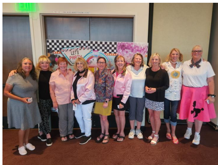
3 rd Place Winners – Gross & Net