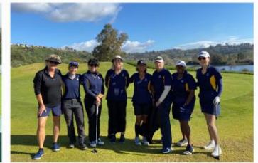
Top: Rancho Bernardo Inn Team Middle Left: Admiral Baker Team Middle Right: Arrowood Team Bottom: Vineyard Team