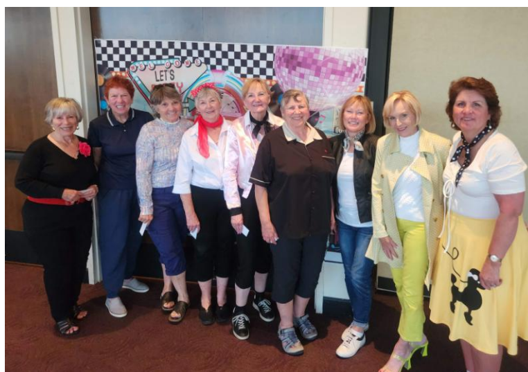
4 th Place Winners – Gross & Net