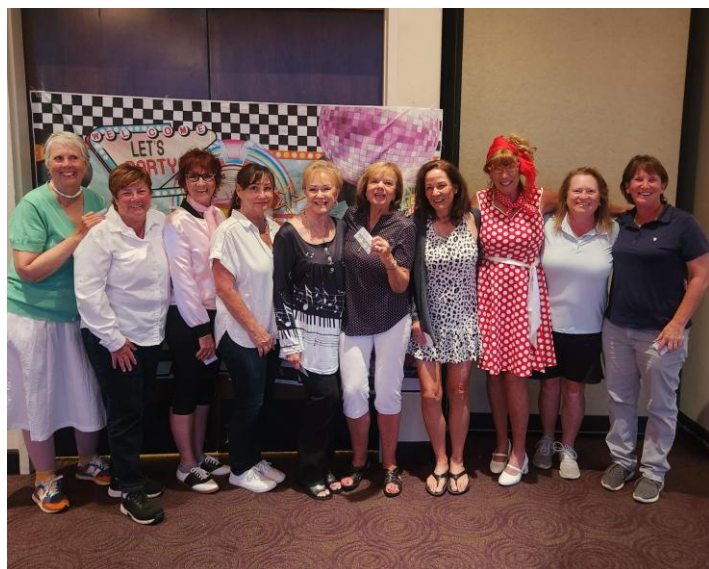
1 st Place Winners – Gross & Net