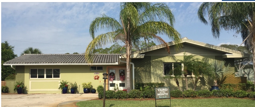
May Yard of the Month on Beechdale Court

Bay Hills will honor all those who have served & are currently serving our country this Memorial weekend. Board members will place flags throughout the neighborhood on Saturday, May 27, and pick them up Tuesday, May 30.