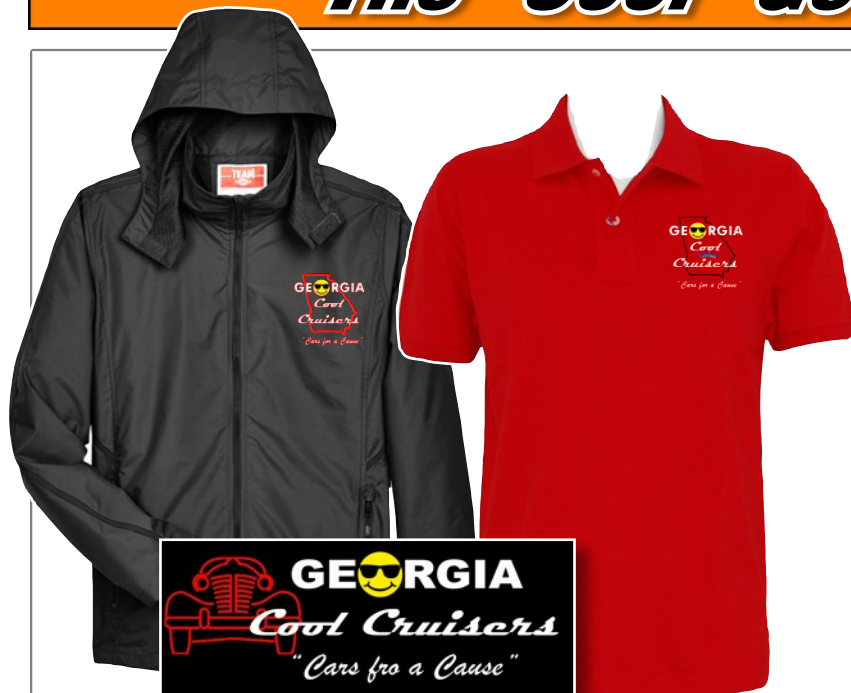
Jacket Back Design