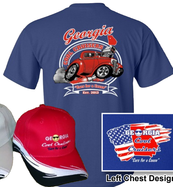
Left Chest Design