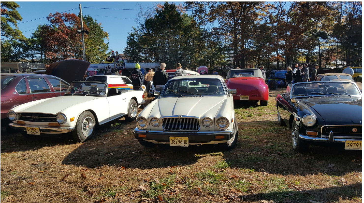
More BMC member cars at Fleming's Pumpkin Run