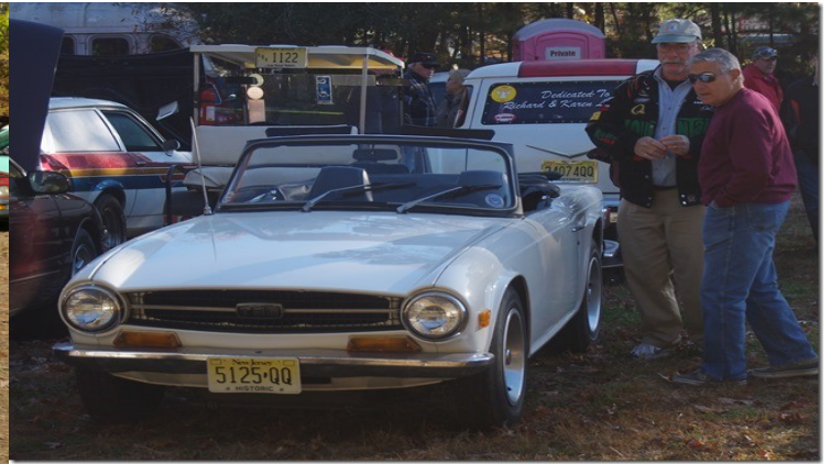
(above) Triumph TR-6 at the Pumpkin Run