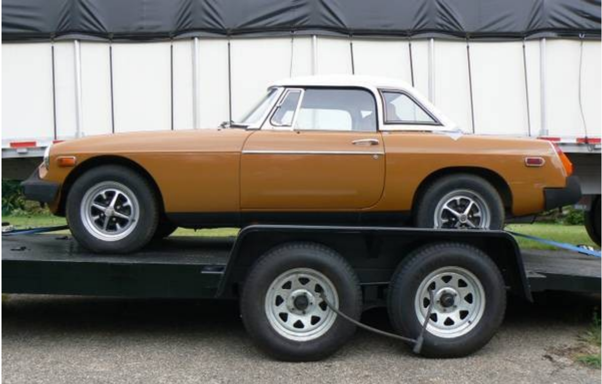
PHOTO OF '76 MGB FROM AD ON PAGE 9