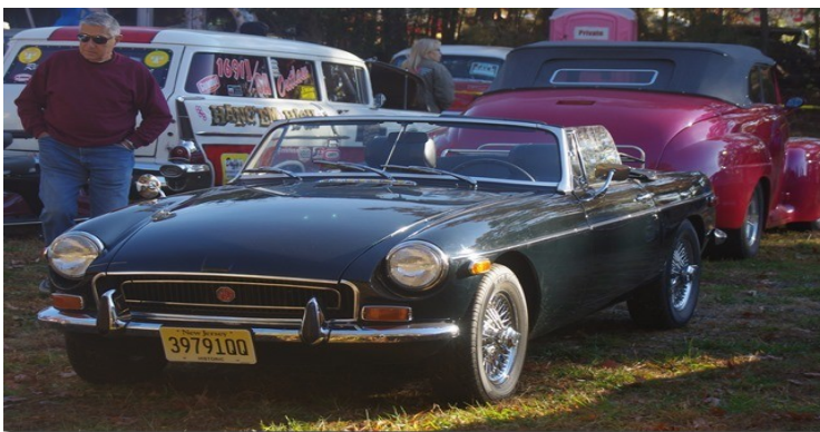
(above) MGB at the Pumpkin Run