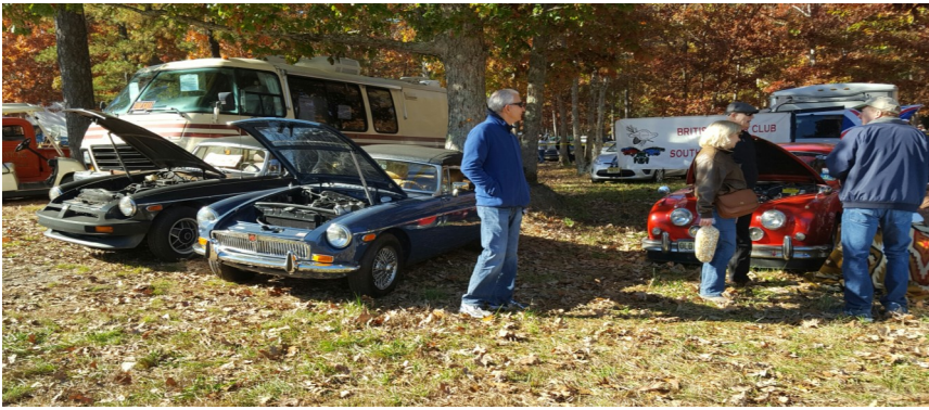
BMC member cars at Fleming's