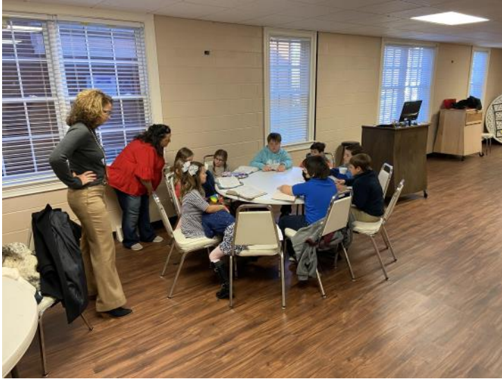
Wallace Kids (Elementary School Children) meet every Sunday morning at 10:00 a.m. in R203.