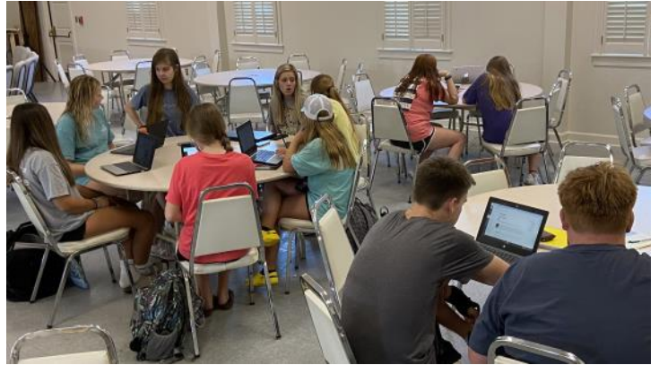
Wallace Students (Middle & High School Students) meet every Sunday morning at 10:00 a.m. for Sunday School upstairs in the Youth Room & Sunday nights at 6:00 p.m. for Youth Group in the Fellowship Hall.