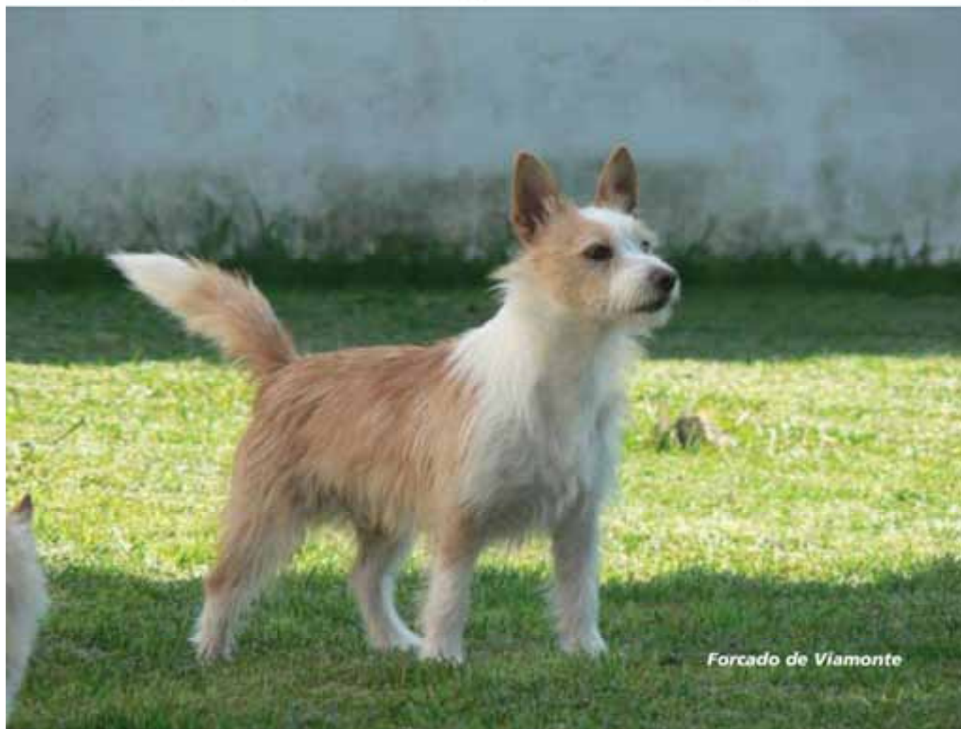
Forcado de Viamonte

A tip I use to give to new breeders is to compare your Wire-hair Pequeno with the finest Smooth-Hair Pequenos. If your dog looks very different or the type doesn't match at all that is probably because you don't have