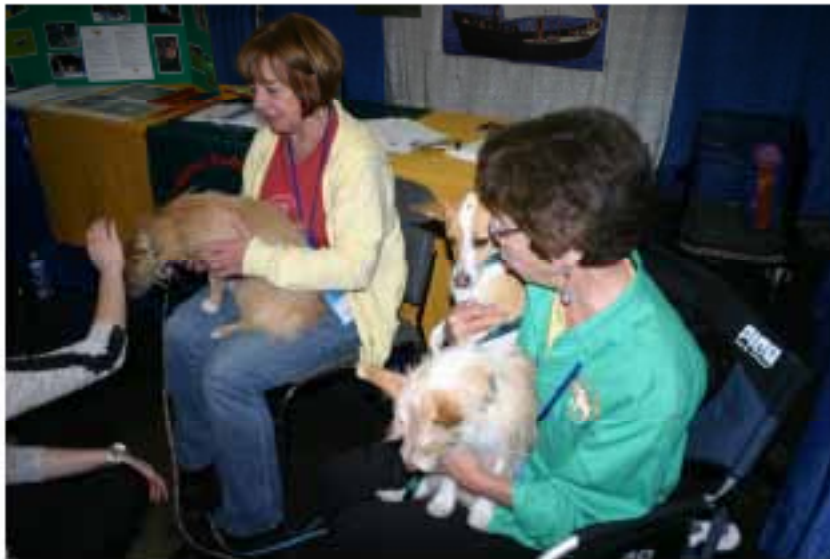
Tired out and heads drooping late Sunday

By Sunday afternoon, the PPPs were falling asleep in our laps.....as were other dogs in other breed booths. They held on, though, and displayed their sweet dispositions till the very end !