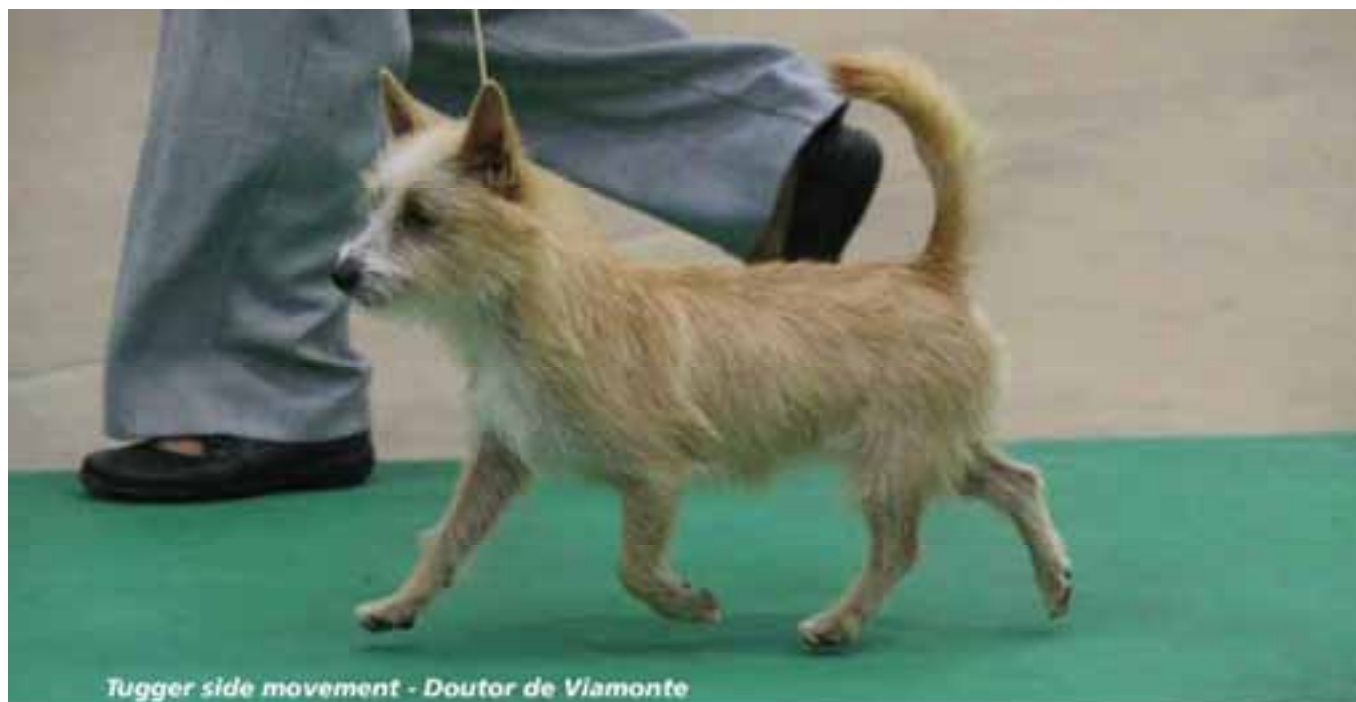
Tugger side movement - Doutor de Viamonte

opinion my biggest achievement because it helped to promote the breed abroad. The internationalization of the breed has been my main goal in the last 15 years and today I can say that part is done, nowadays the Podengo Pequeno is in fact an international breed. Now we can concentrate in a different goal.