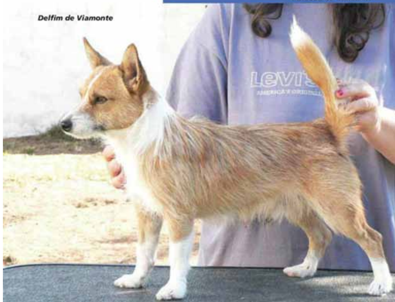
Delfim de Viamonte