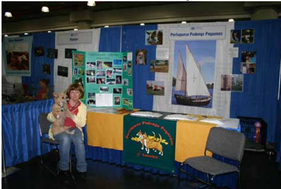
Before the crowd arrived

The Portuguese Podengo Pequenos of America hosted a breed information booth again this year. This event, which is put on by the American Kennel Club and the International Cat Association, hosts about 40,000 spectators annually. It gives the general public, along with many dog and cat owners and canine handlers and trainers of all sorts, a chance to meet personally many of the recognized dog and cat breeds that are here in America. There are also dog breeds present that are in the AKC Foundation Stock Service. It is an honor to be able to have your breed “meet” the public and to answer their individual questions.