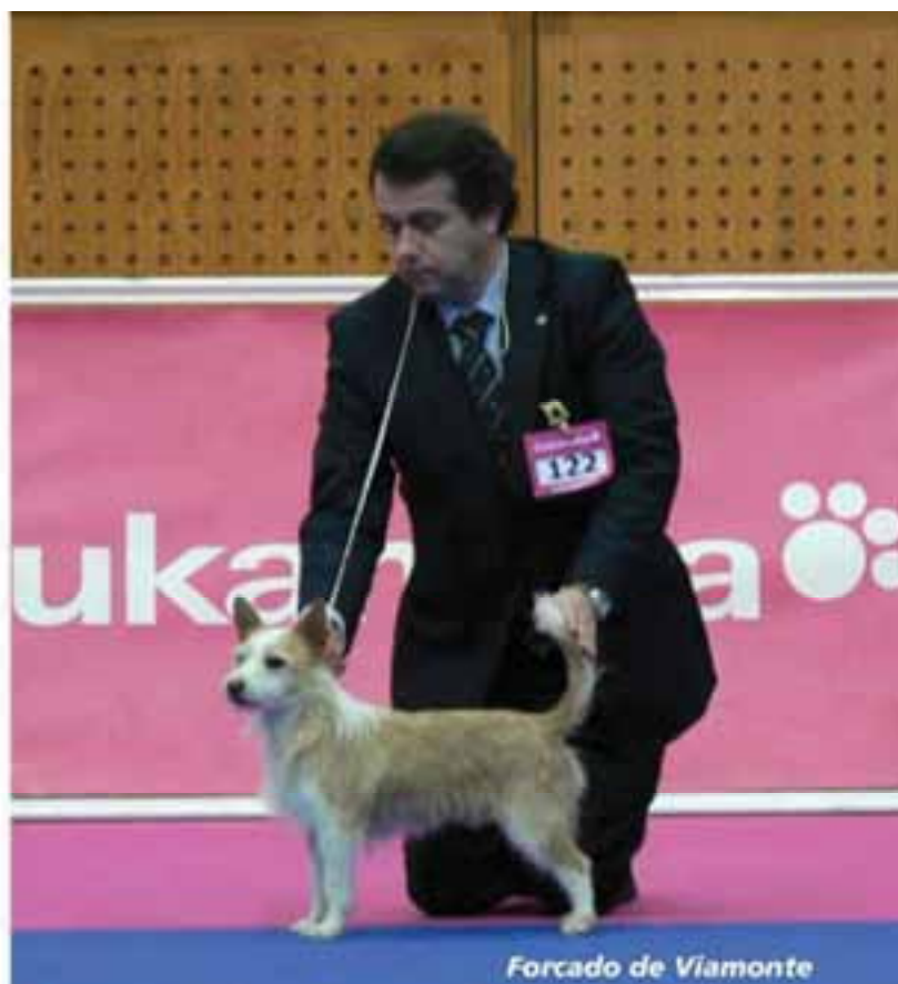
Forcado de Viamonte

I know there are a few Podengos doing great at Lure coursing specially in some northern European countries which is not a surprise as they have a natural instinct to hunt and pursuit. I have dogs of my own kennel doing lure coursing and the feedback I've had from their owners is great.