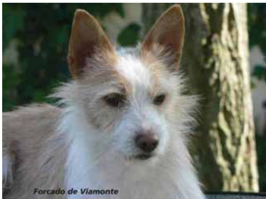
Forcado de Viamonte

My advice would be not to forget to give your Podengo proper exercise, they like the outdoor activities, no matter what dog activities you would like to do with your dog I'm sure your Podengo can do it with you.