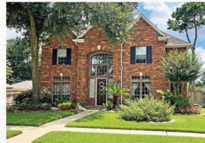
Section 2 7719 Allegro Drive