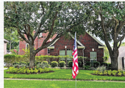
Section 3 8623 Prelude Court