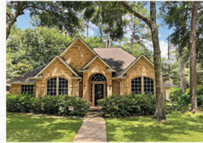
Section 1 7802 Ensemble Drive