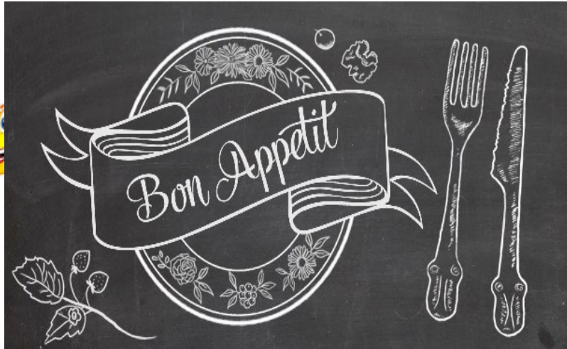
Tomato Basil Soup Recipe