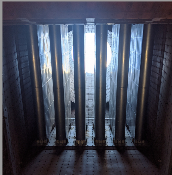
Silencer Panels Optimized for New Exhaust Profile