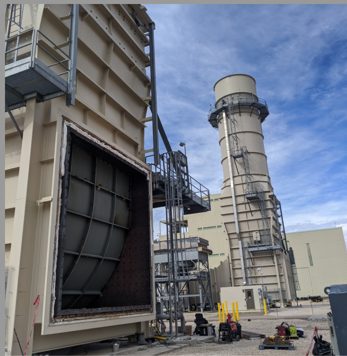
Curved Simple-Cycle Back Wall

Email: sales@rapidbelts.com Web: www.rapidbelts.com