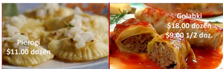
Pierogi $11.00 dozen