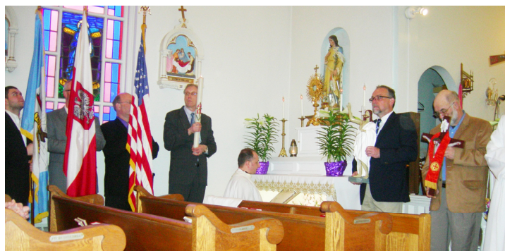
Procession pauses to pray at the Blessed Sacrament