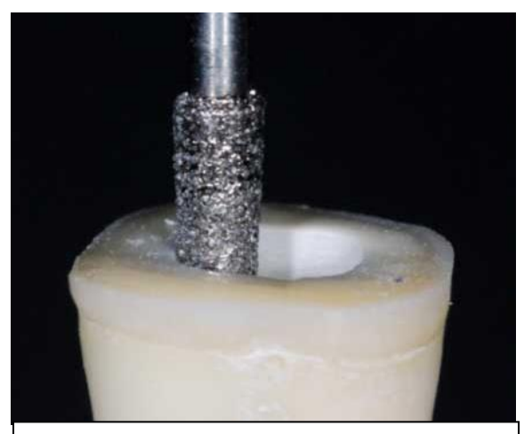
А cylindrical-conical course grit diamond is used to prepare the pulp chamber.

A cylindrical-conical course grit diamond with an occlusal taper of 7 degrees is used to remove the undercuts in the access cavity being prepared such as to make the pulp chamber and endodontic access cavity continuous. Diamond should be held parallel to the long axis of the tooth, to avoid excess pressure and pulpal floor should be kept untouched. The walls of the pulp chamber should not be reduced deliberately as it will reduce the width of remaining enamel leading to more chances of tooth fracture. The recommended endocrown measurements are 3 mm diameter and 5 mm depth for the first upper premolars and a 5 mm diameter and a 5 mm depth for molars.<sup>23</sup> So, the minimum cavity depth should be 3 mm.<sup>23,24</sup>