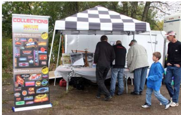
There was a wide range of Meadowdale memorabilia for the guests.

Meadowdale International Raceways Preservation Association Individual Membership Application Fee: $35 Club or Organization Membership Application Fee: $100