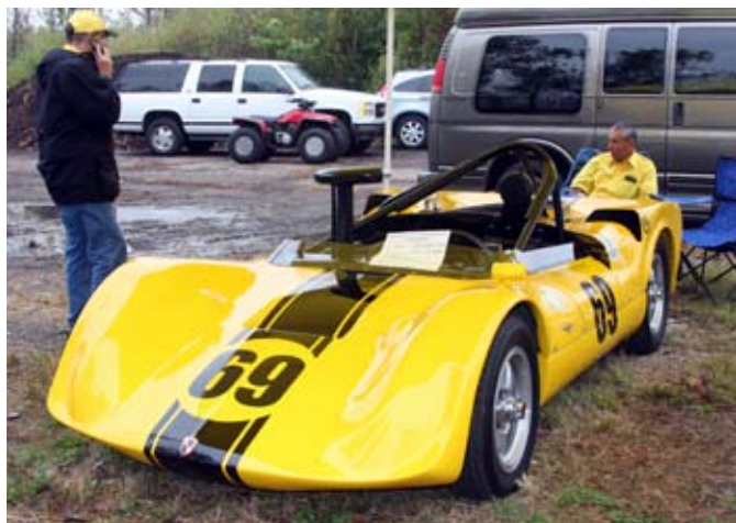
Vintage 1964 Crusader VSR, a VW powered Sports Racer.