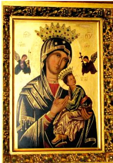
Our Lady of Perpetual Help - St. Luke Catholic Church Robin Howard, December 2009

Registration 7:00-7:25 pm - $15/person both evenings or $8/person 1 evening 7:30 - 8:40 pm Rehearsal * 8:40 pm Refreshments * 9:00 pm Performance