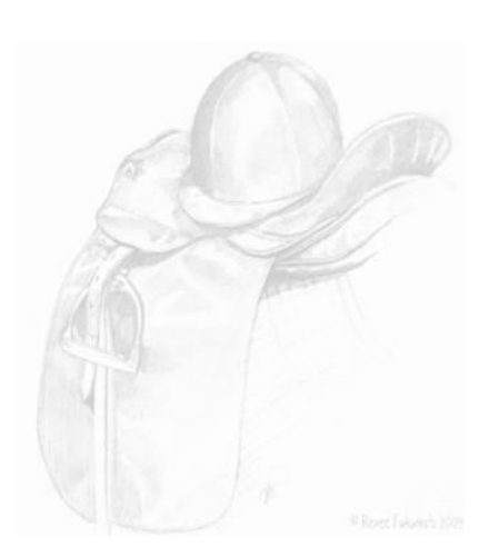
USEF MEMBERSHIP STATEMENT

Life, senior active and junior active members shall be eligible to participate in all classes at Regular Competitions, Eventing Competitions at the Modified Level or above and Combined Driving Competitions at the Advanced Level, Dressage, Reining and Vaulting Competitions and Endurance Rides. A nonmember may participate as a handler, rider, driver, owner, lessee, agent, coach or trainer at Regular Competitions, Eventing Competitions, Dressage Competitions, Reining Competitions and Combined Driving Competitions upon payment of a $45 Show Pass fee. Participants in the following classes are exempted from the Requirements of this rule: 1) leadline; 2) exhibitions; 3) games and races; 4) classes for 4-H members; 5) walk trot (exception: Friesian performance FR222) and academy classes (academy classes are classes limited to horses used regularly in a lesson program); 6) USDF introductory level tests, pas de deux and quadrille classes; 7) NRHA Endorsed Reining Competitions. 8) Opportunity classes, 9) citizens of other nations who have proof, in English, of current membership in good standing of their own National Federation, 10) USEA beginner novice division; and 11) assistant handlers in Dressage Sport Horse Breeding classes.