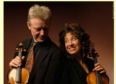
Co-directors of REBEL Ensemble perform in a Downtown Music at Grace program