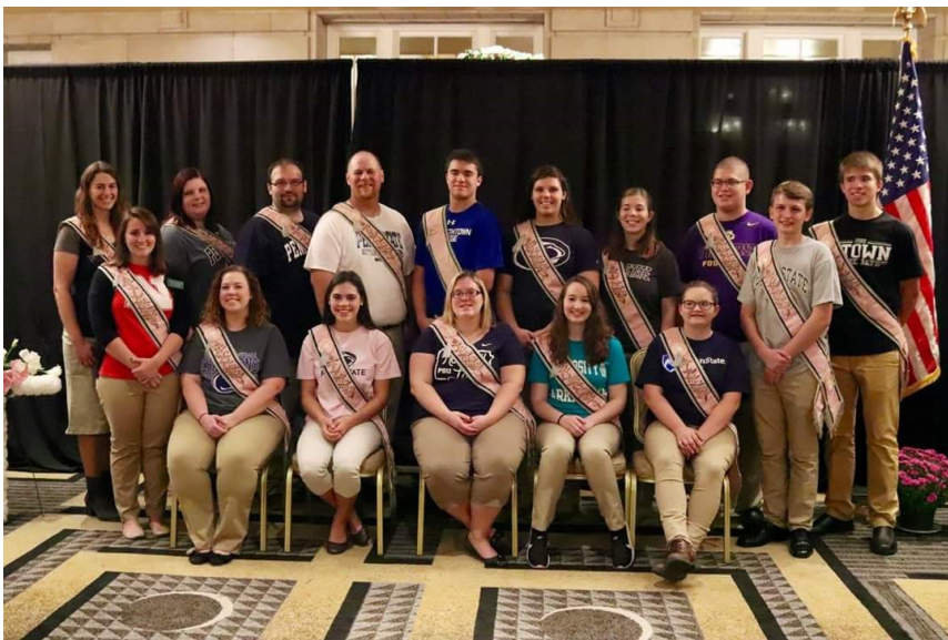
YOUTH THROUGHOUT THE STATE FILL OFFICER CHAIRS AT STATE SESSION 2017

Please contact your Subordinate F.A. Director or go on the web-site ( www.pagrang.org ) to retrieve the information.