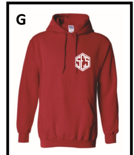
G Red SES Hoodie Youth XS-L Adult XS-XL $20