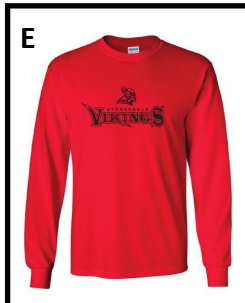
E Red Vikings LS Tee Youth XS-L Adult XS-XL $18