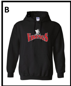
B Black Vikings Hoodie Youth XS-L Adult XS-XL $20