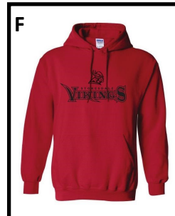
F Red Vikings Hoodie Youth XS-L Adult XS-XL $20