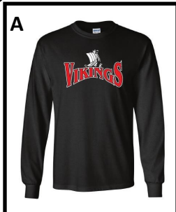
A Black Vikings LS Tee Youth XS-L Adult XS-XL $18