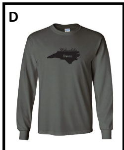
D Gray Stokesdale LS Tee Youth XS-L Adult XS-XL $18