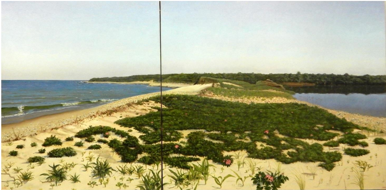
Fig. 1. Frank Lind, Oyster Pond . 2019, Oil on canvas, 60 x 122 inches. Collection of the artist.

Opening Reception: Wednesday, April 17, 3:00 – 5:00 PM