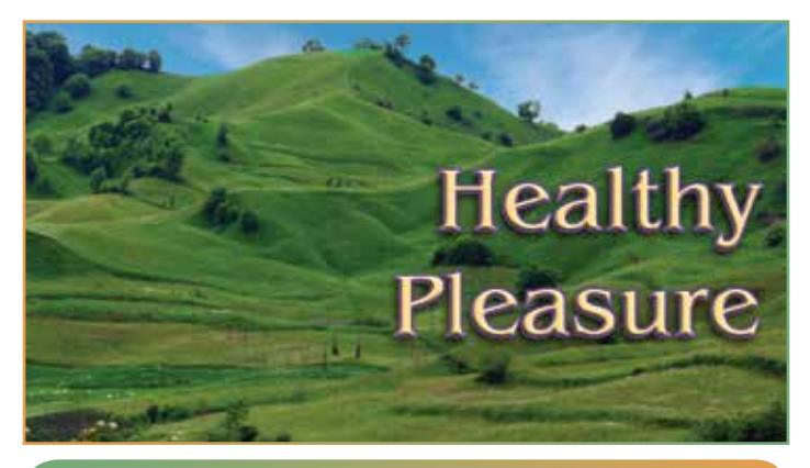
Engaging in Simple, Healthy Pleasures Can Restore Balance to our Hectic Lives

Pleasure guides us to better health. When experiences are enjoyable, we want more of them. Our bodies tell us that sleep, reproduction, eating, companionship, and exercise – to name just a few of our common daily activities – are enjoyable. Our survival depends on engaging in these activities. And we define these basic actions as sources of fun or pleasure, and this may explain why we feel impelled to engage in them.