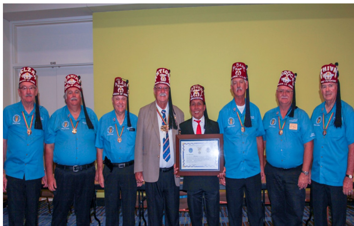
Egypt Legion of Honor and IALOH Officers carrying the colors at the 2018 Imperial parade