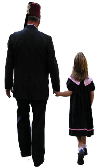
Shriners Helping Children