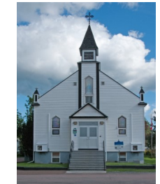
Our Lady of Mercy 11 St. Andrews Street Pointe-du-Chêne, NB