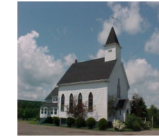
Saint Lawrence O'Toole 2340 Route 115 Irishtown, NB