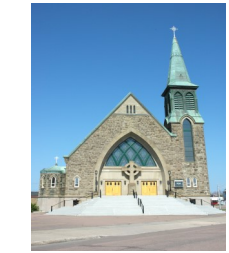
Saint Augustine's 340 Dominion Street Moncton, NB