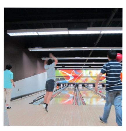
Ten Pin Bowling