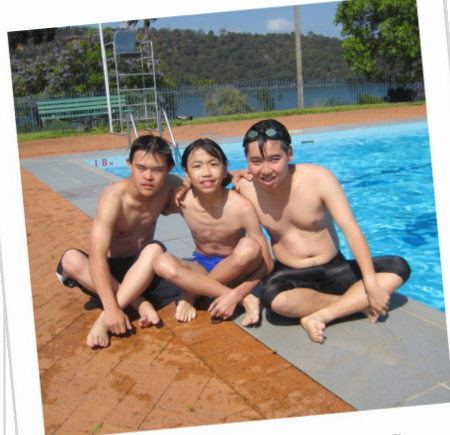
Milson Island Sport Recreation Camp