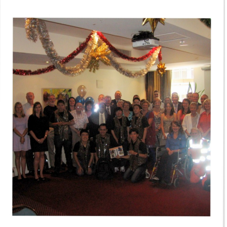
Volunteer Team of the Year