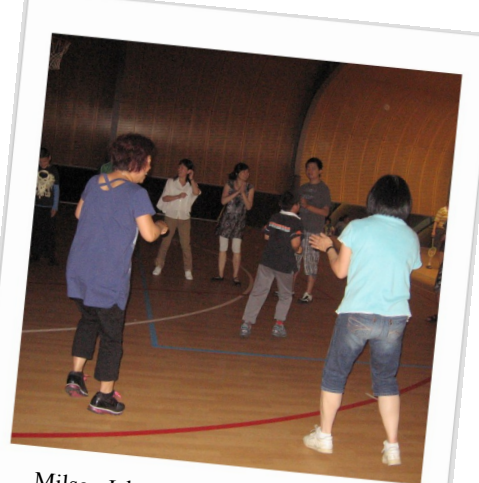
Milson Island Sport Recreation Camp