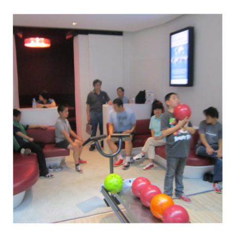
Ten Pin Bowling