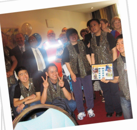
Volunteer Team of the Year