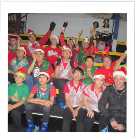
Christmas Ice Skating