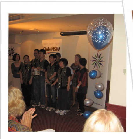
Volunteer Team of the Year