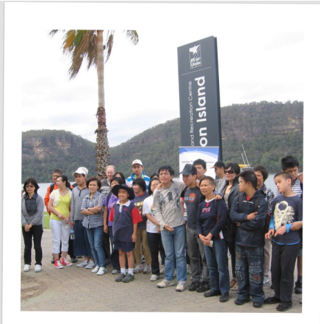
Milson Island Sport Recreation Camp