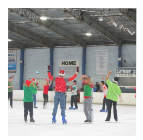
Christmas Ice Skating