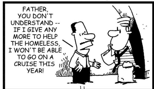
32nd SUNDAY IN ORDINARY TIME