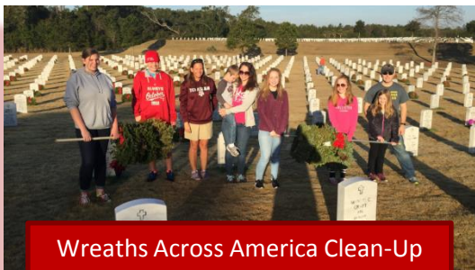
Wreaths Across America Clean-Up At Barrancas National Cemetery