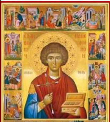
Gr. Martyr and Healer St. Panteleimon

PLEASE PRAY FOR HEALING, COMFORT, AND SPIRITUAL PEACE