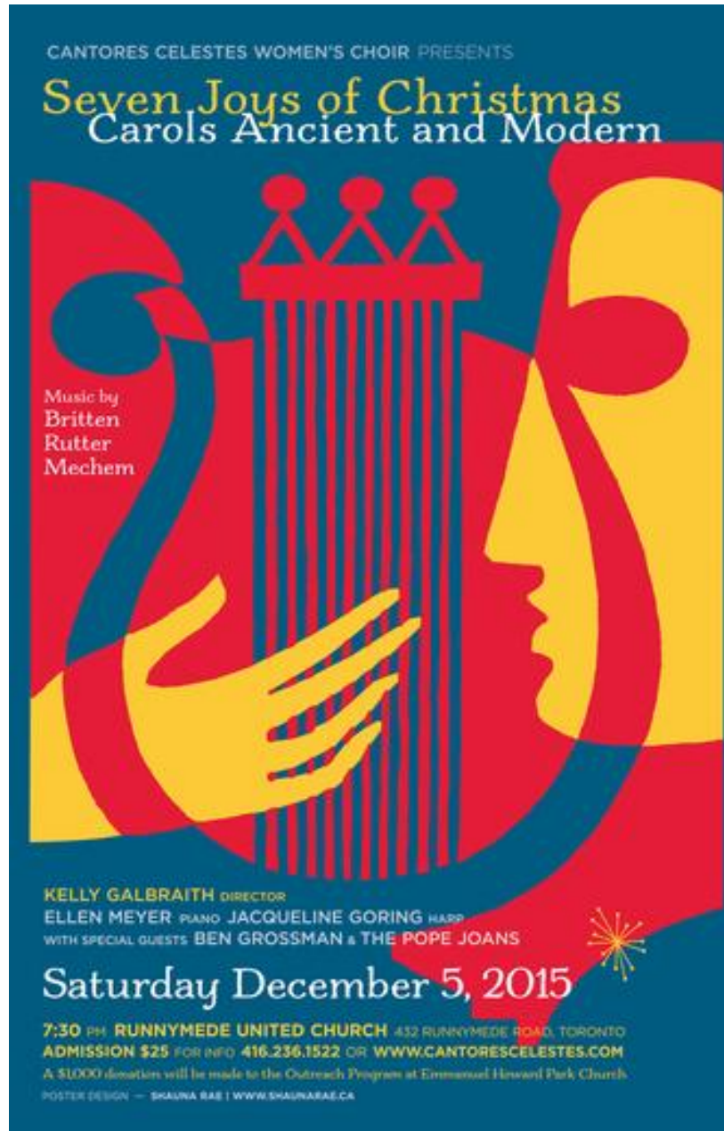
Poster by Shauna Rae

Cantores Celestes has its own page on Facebook! Come check us out!