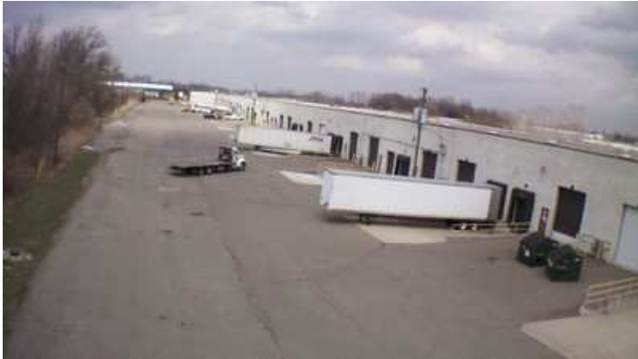
Airport Business Center (13)