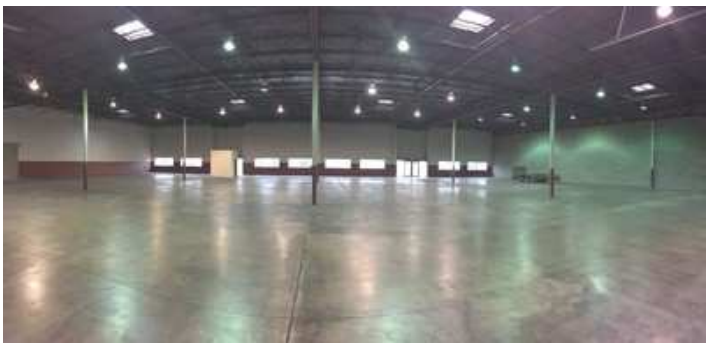
Airport Business Center Suite114-117