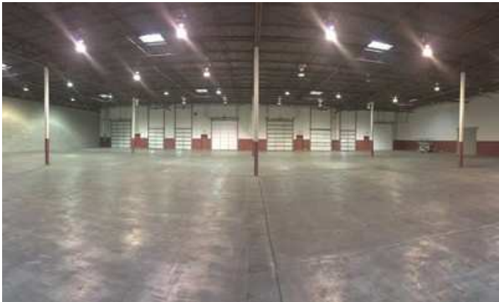
Airport Business Center Suite114-117 (2)