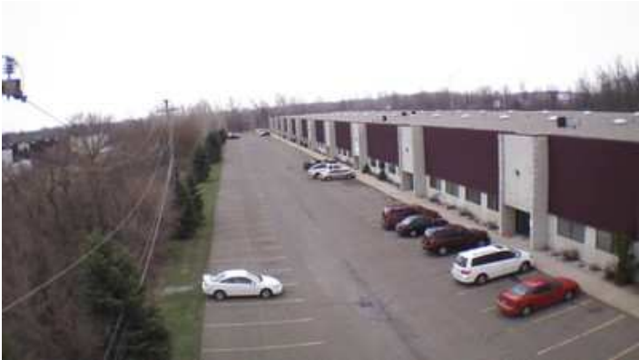
Airport Business Center (10)