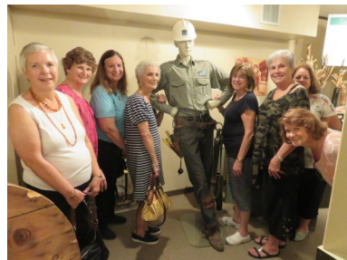
Newcomers club members enjoyed posing with a telephone lineman.