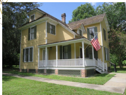
The Waterhouse Residence was a middle-class home built on Lake Lily in Maitland in 1884.