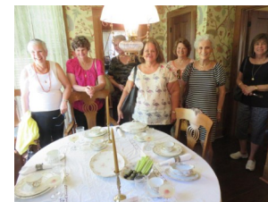
Group members inside the Waterhouse residence