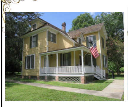
The Waterhouse Residence was a middle-class home built on Lake Lily in Maitland in 1884.