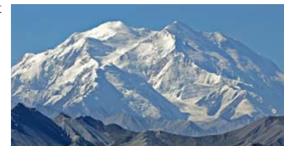
Mt. McKinley “Denali”

While in Denali you may choose to do an optional activity such as a helicopter ride or river rafting. As we leave Denali we will have one more chance to see Mount McKinley. After lunch we will travel to Anchorage for an informal city tour, drive around Lake Hood and see the busiest airport in the world on water; pass Earthquake Park and many other interesting landmarks along the way. This evening is yours for shopping and dinner in downtown Anchorage.