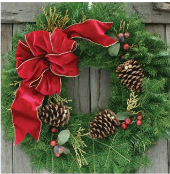
Cranberry Splash $29