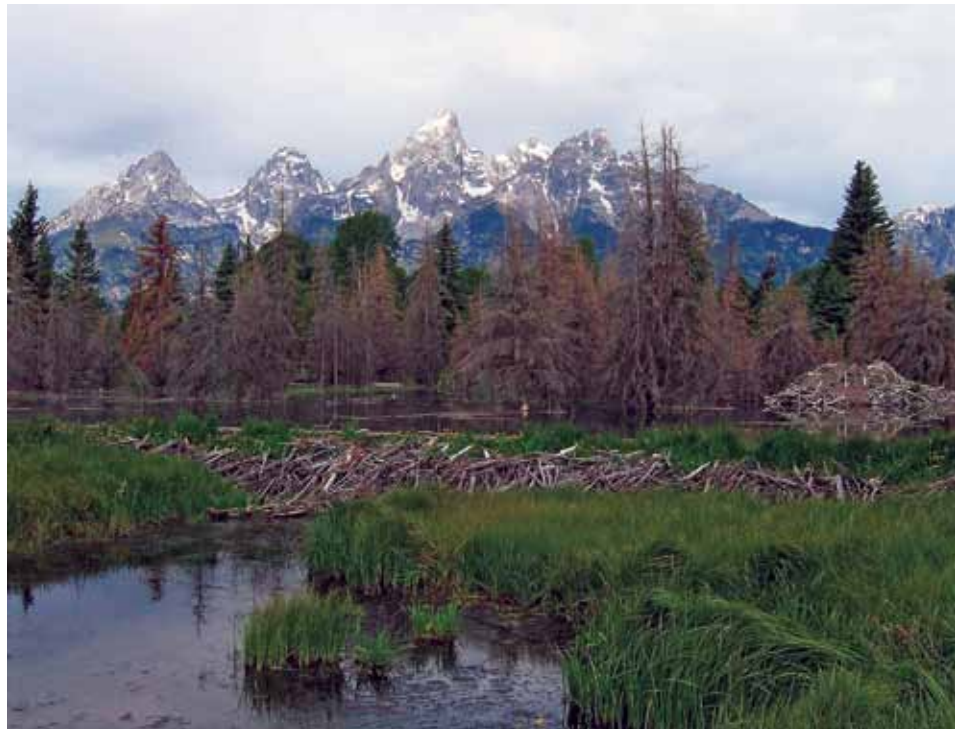
Figure 5. This beaver dam, pond, and lodge are located along the Snake River in Grand Teton National Park, Wyoming. Such public lands could be ideal places for more beaver wetlands.