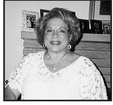
There's always hope for hopelessness