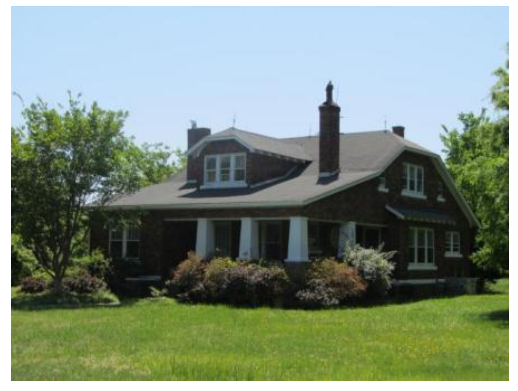
Figure 53. NCDOT Survey #15, Edwards House (GF-8177), 7210 Burlington Road, Guilford County, northwest elevation, looking southeast.