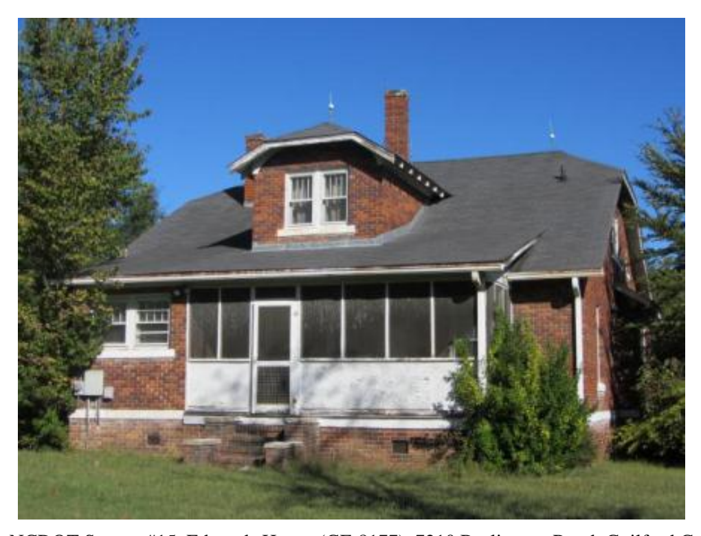
Figure 55. NCDOT Survey #15, Edwards House (GF-8177), 7210 Burlington Road, Guilford County, south elevation, looking north.