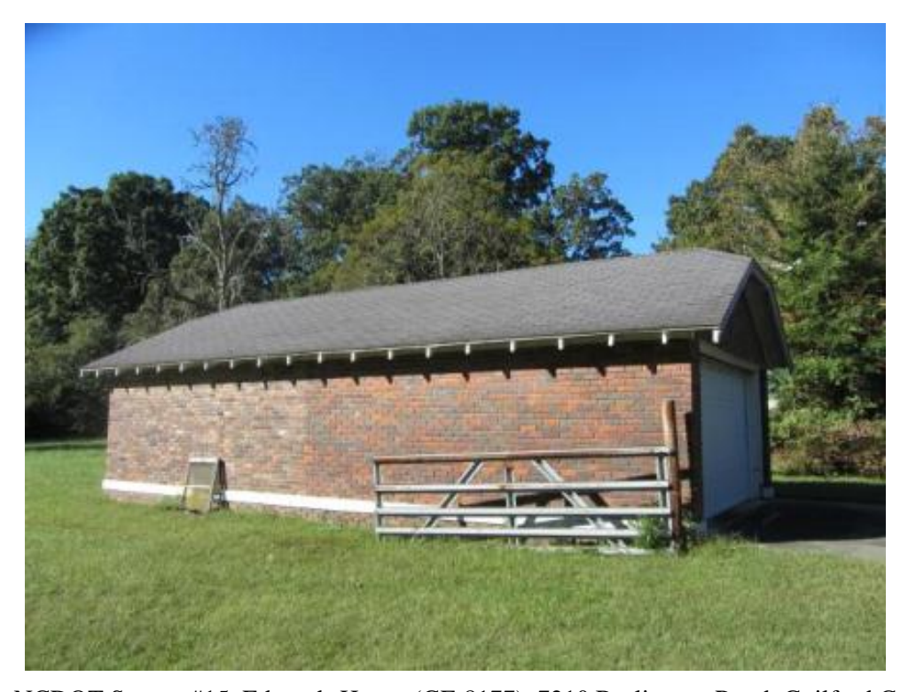
Figure 59. NCDOT Survey #15, Edwards House (GF-8177), 7210 Burlington Road, Guilford County, garage, east elevation, looking southwest.