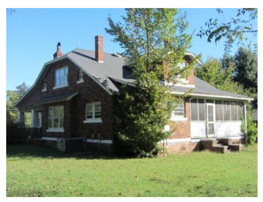
Figure 56. NCDOT Survey #15, Edwards House (GF-8177), 7210 Burlington Road, Guilford County, southwest elevation, looking northeast.