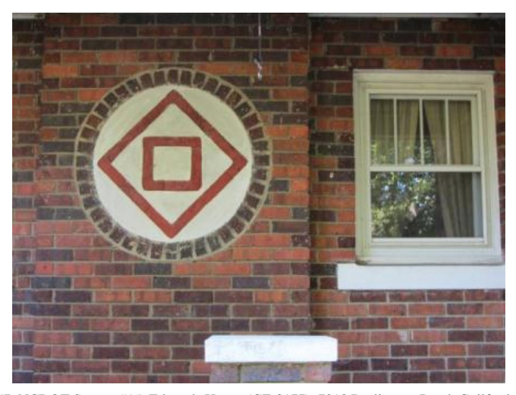
Figure 57. NCDOT Survey #15, Edwards House (GF-8177), 7210 Burlington Road, Guilford County, detail of west wall beneath porch with decorative roundel, looking east.