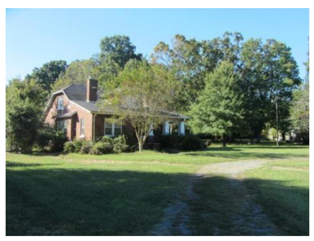
Figure 52. NCDOT Survey #15, Edwards House (GF-8177), 7210 Burlington Road, Guilford County, northeast elevation and surrounding property, looking southwest with driveway in foreground.