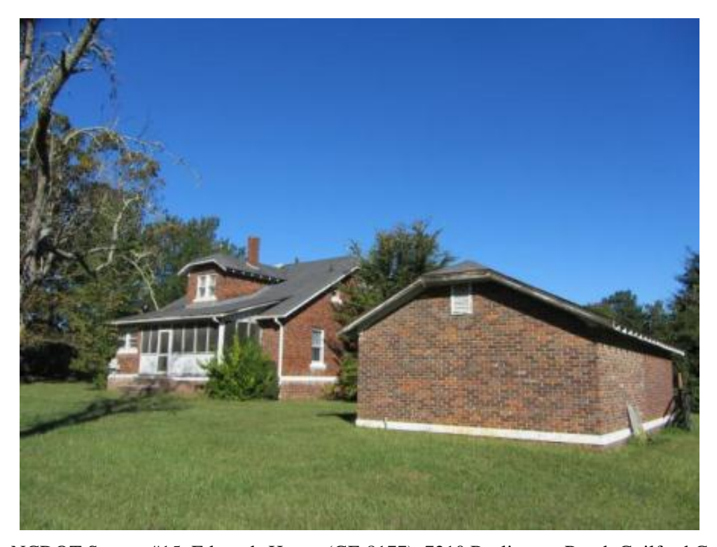
Figure 61. NCDOT Survey #15, Edwards House (GF-8177), 7210 Burlington Road, Guilford County, view of house and garage in foreground, looking northwest.