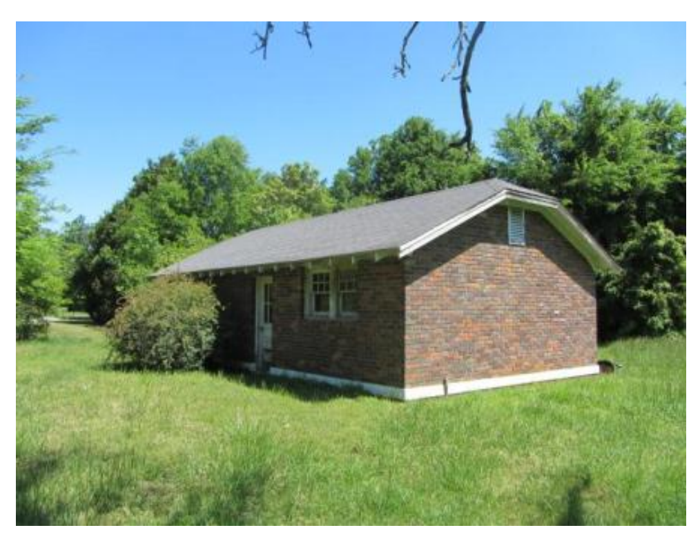
Figure 60. NCDOT Survey #15, Edwards House (GF-8177), 7210 Burlington Road, Guilford County, garage, southwest corner, looking northeast.