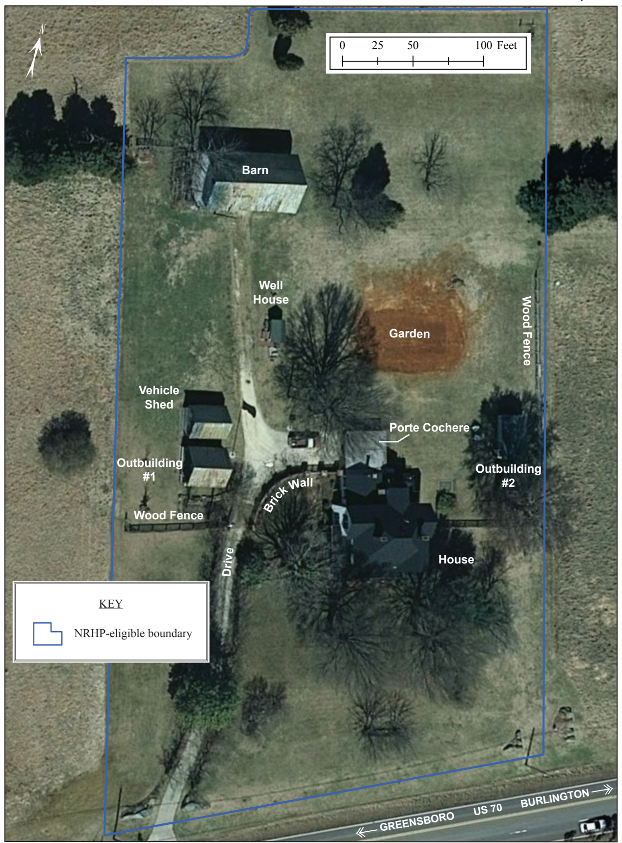
Figure 50. NCDOT Survey #29, Cyrus Augustus Wharton House (GF-2121), 6709 Burlington Road, Guilford County, aerial photograph (2010) showing recommended NRHP boundary.