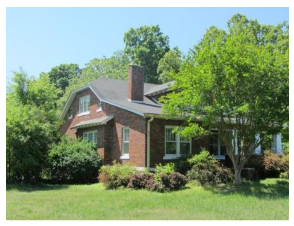
Figure 54. NCDOT Survey #15, Edwards House (GF-8177), 7210 Burlington Road, Guilford County, northeast elevation, looking southwest.