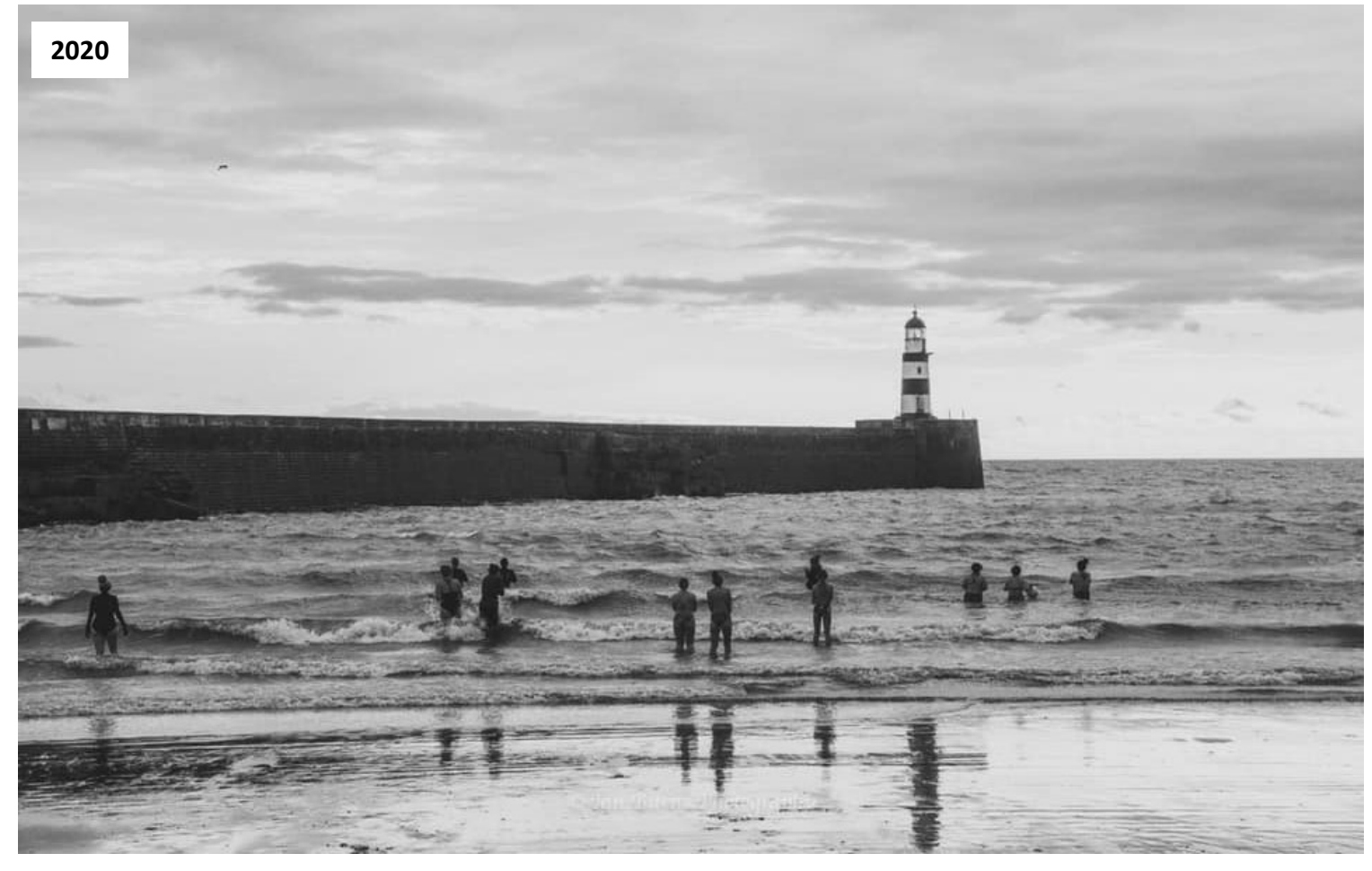
At Seaham Harbour