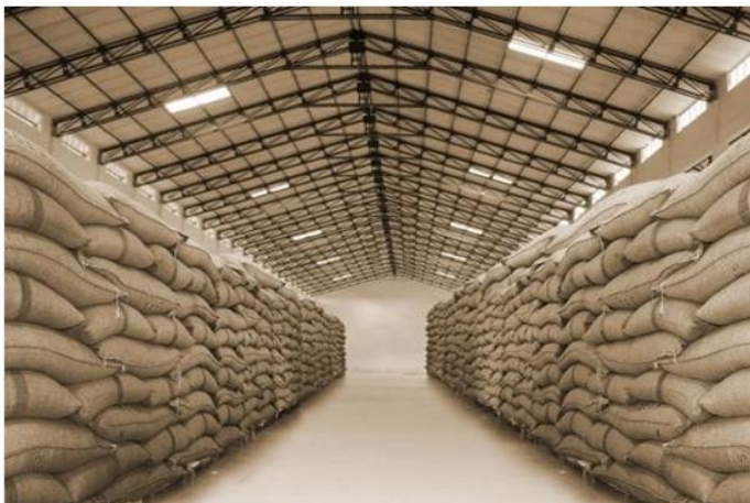
Fig.1: Food grains stored at warehouses in India During

Agriculture sector being the backbone of the Indian economy deserves food security. Today, food preservation is very important to fulfill the food supply chain needed by the developing countries like India. There is a huge need for preservation, protection, storage, distribution and consumption of food at later stage. The main objective of this project is to preserve the food grains from rodents invading at warehouses and also threat to destruction of stored crops, due to variation in temperature, excess humidity, fire, theft, rain, flood, etc. So that stored food grains can be delivered as and when required (real time). In this paper we are integrating Internet of Things with smart sensors to improve the efficiency of food preservation in warehouse.